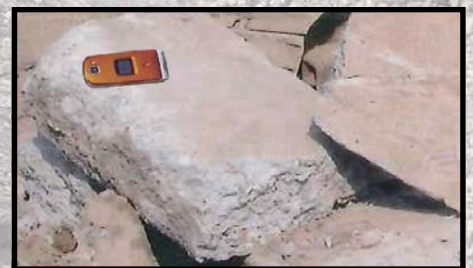
Big Concrete can also be Crushed