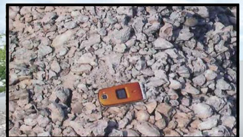
40 mm Crusher-Run Stone